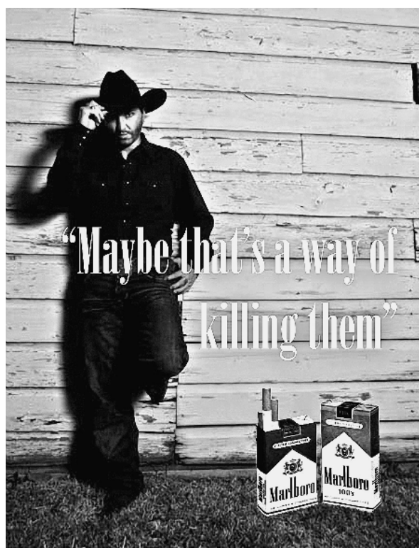
Figure 4.1 ‘Maybe that’s a way of killing them’

(Clough and Willse 2011). A necessary component of the refugee discourse, the desire for freedom is eerily present in the branding of cigarettes. 1 It is no accident that the ‘Don’t be a Maybe’ Marlboro advertising campaign in Germany claimed ‘There is no freedom in maybe’. Neither is it surprising that an online design competition for Marlboro included a pack of cigarettes adorned with an American flag next to the phrase ‘packed with freedom’. The promise of freedom is also present in the 2012 ‘Be Marlboro’ campaign that targeted Indonesian youth whose ideal future is ensured against the uncertain present: ‘No poems finished, no mountains climbed, oceans crossed, no freedom won, no city lights, no love letters, this world would be nothing if we just said maybe, so let it out, set it free. Don’t be a maybe. Be Marlboro’ ( Tobacco Tactics ). If Marlboro is ‘packed with freedom’, death may be the price to pay for the self-responsible subject who desires to experience the sweet taste of the ‘Marlboro Country,’ knowing its risks. If queer life is imbued with freedom in the ‘West’, death is the price to pay for the desiring queer refugee whose rights are taken away in the name of rights in the ‘free country’ (see Figure 4.1).