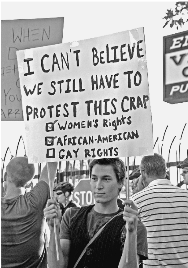
Figure 9.1 Poster from a protest following the passage of California's Proposition 8 same-sex marriage ban