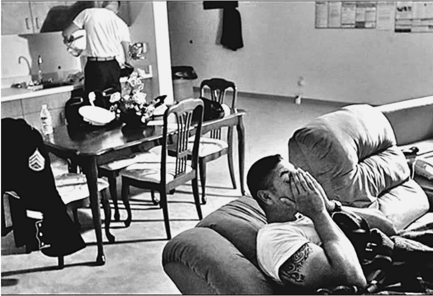
Figure 2.3 Taking a break at the mortuary

'Final Salute'